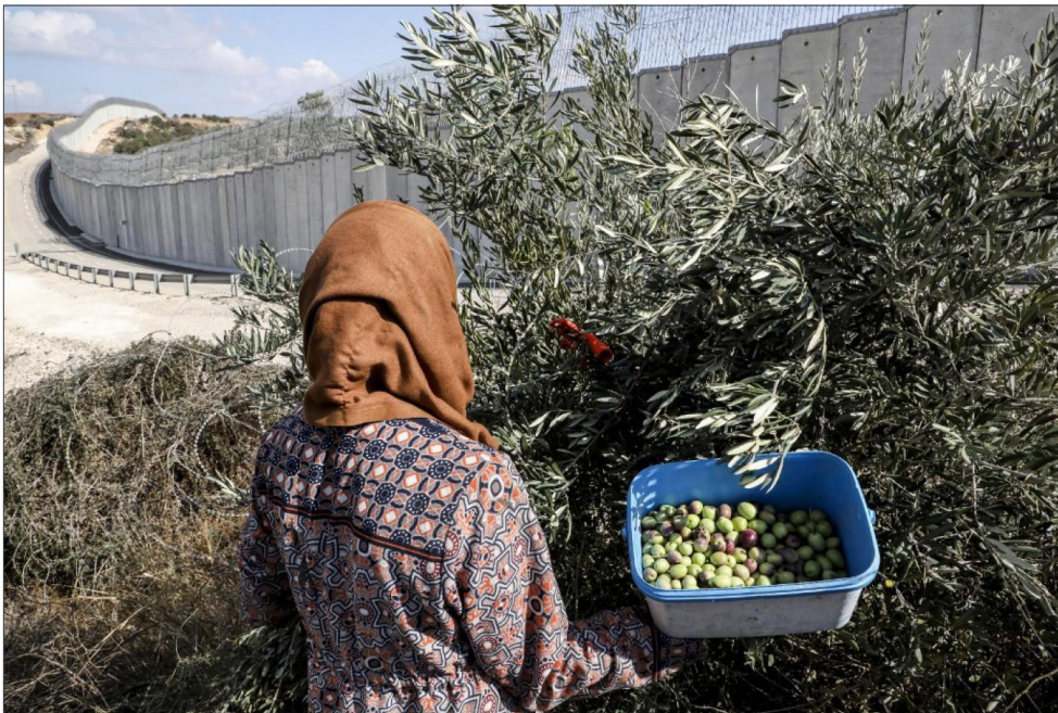
Palestinians harvest olives from their lands which currently lie on the Israeli side of the controversial separation barrier (background) near the West Bank village of Dura.